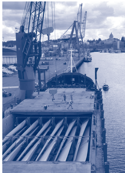
The Industrial Dawn (above) at the Port during her May visit. The vessel contained 120 windmill blades from Brazil, each weighing on average 35,000 pounds. These blades stayed in the Port's cargo yard during a 30-45 day period until they could all be transported via truck to a wind energy site in Eastern Oregon.

working with DOE on plans for maintenance dredging of the berthing area. Dredging will remove dioxin and other contaminants while simultaneously returning the berthing areas to their permitted depths. The Port is also committed to working with regional partners to develop a broader strategy to clean up Puget Sound.