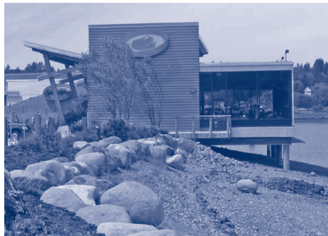
As part of constructing the foundation for the new Anthony's Hearthfire Grill at NorthPoint, 220 creosote piles were removed and replaced with pre-cast concrete piles.

Commissioner Telford's column on Page 2 provides further information about this important project.